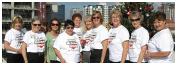
RMH staff celebrates the "topping off" at the new All Children's Hospital, future home of our fourth Ronald McDonald House.