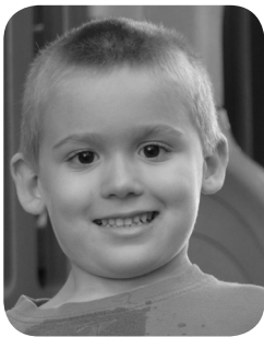
ST. PETE CENTRAL