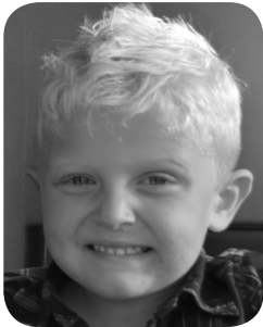
ST. PETE EAST